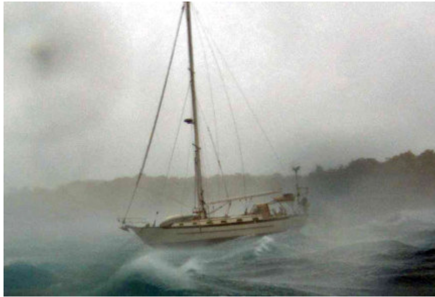
The Boston-based Pacific Seacraft 40 Shango rides Cyril's fury in Neiafu Harbor.