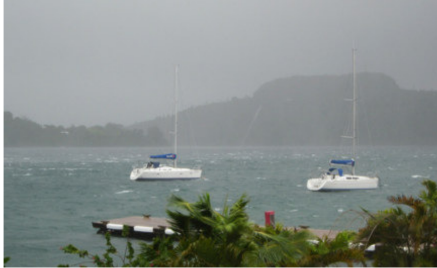
Earlier, squally conditions during the big game made cruisers wonder if something bigger was coming. Seen here are two Moorings bareboats riding a 35-knot squall.